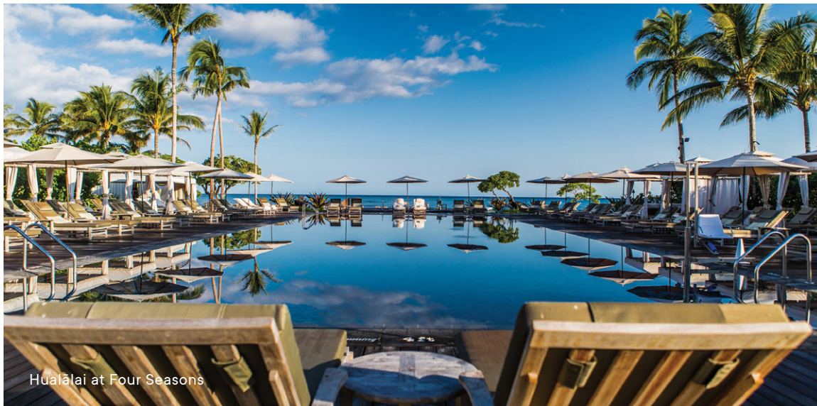
Hualālai at Four Seasons