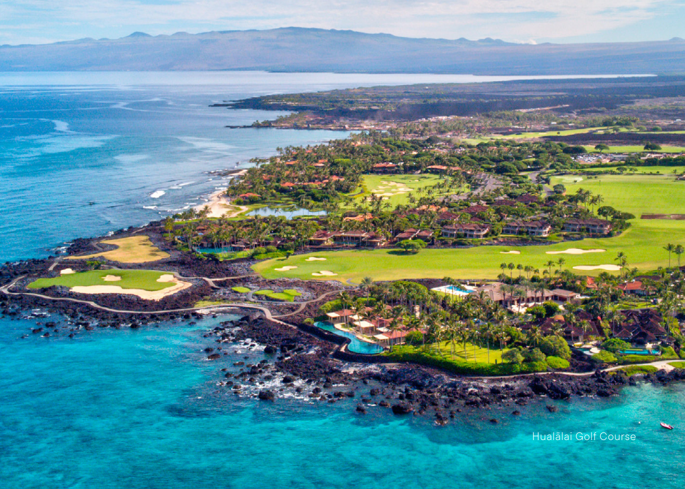
Hualālai Golf Course