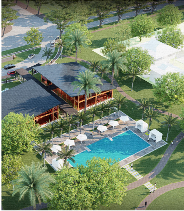
Nānā Kai Clubhouse

The global elite who call the Big Island home increasingly share a collective value: preserving paradise. From solar infrastructure to reef-safe landscaping, environmental awareness is a defining feature of modern Hawaiian luxury.