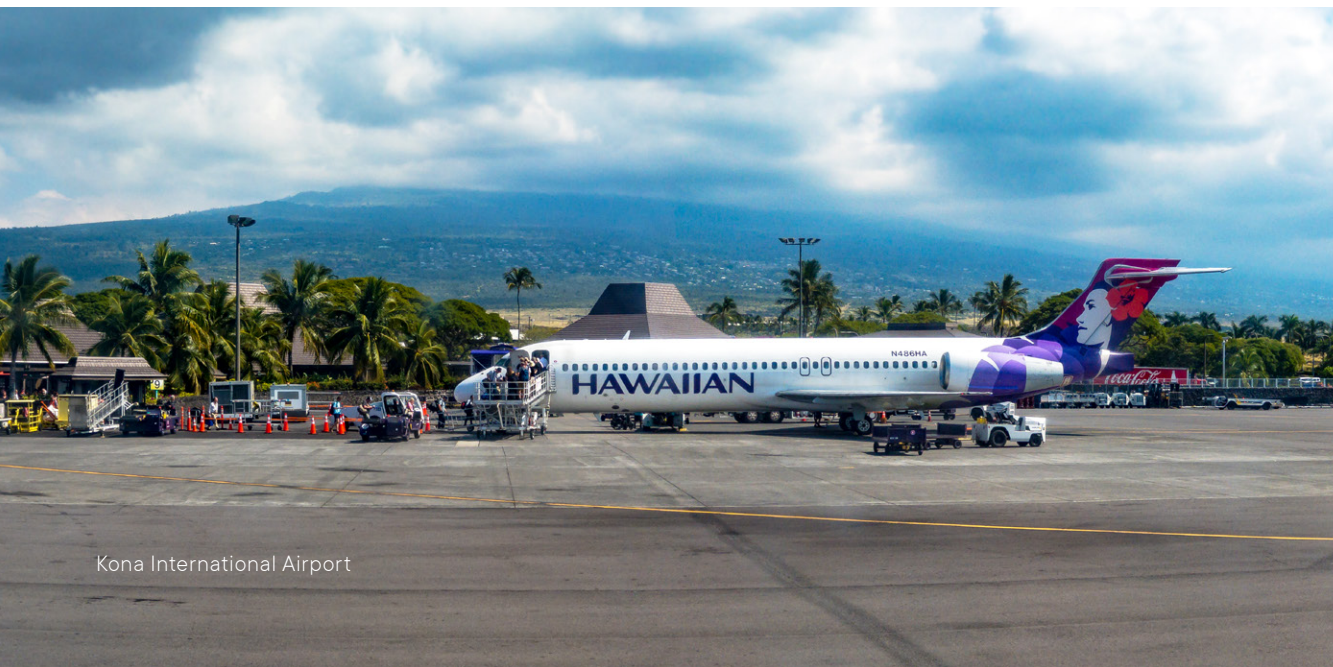
Kona International Airport

Elite international schools and cultural programs make the island increasingly attractive for multigenerational families.