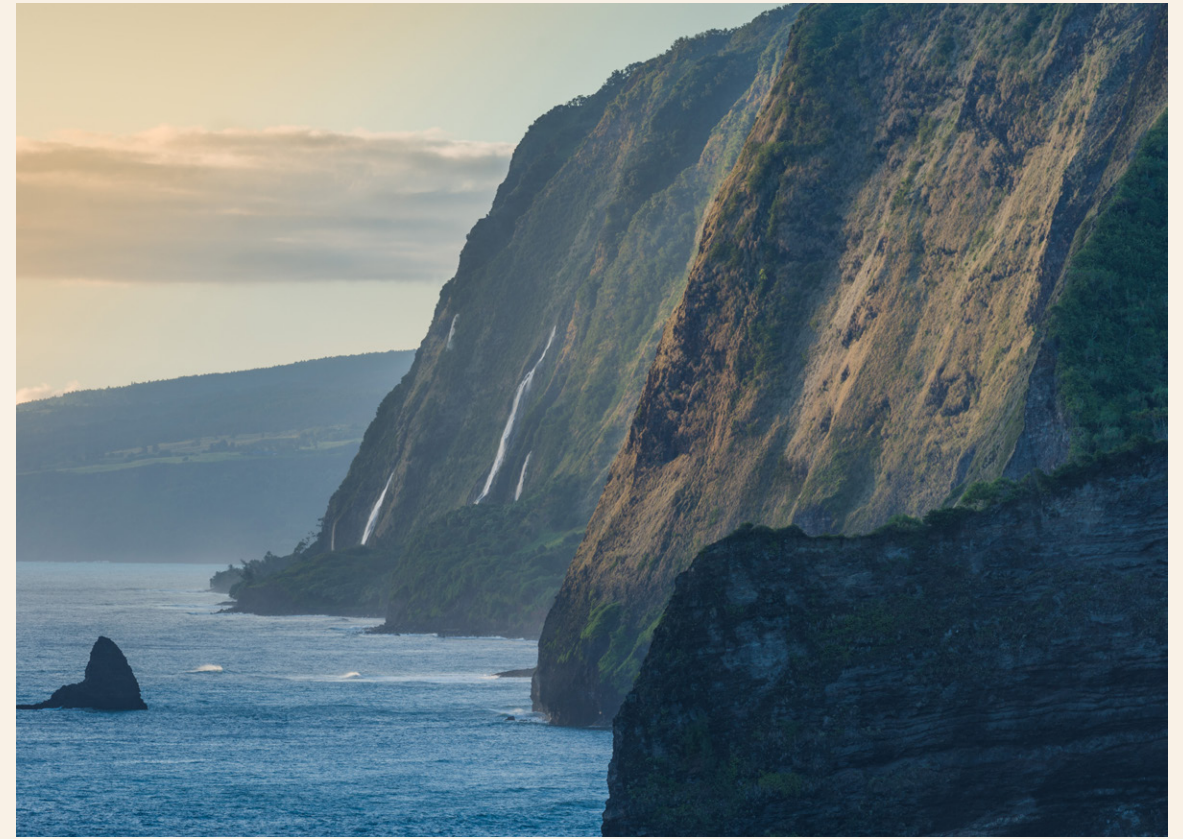
Pololū Valley Lookout & Trail During Sunrise

From Mauna Kea Resort, with its legendary golf and restored Rockefeller legacy, to Hualālai at Four Seasons – home to a select circle of global entrepreneurs and philanthropists – the Kohala Coast represents the pinnacle of island living. Prestigious gated enclaves such as Kūki'o, Kaunaoa, and Mauna Lani Estates offer custom ocean-view homes, private clubs, and curated community experiences designed around art, wellness, and nature.