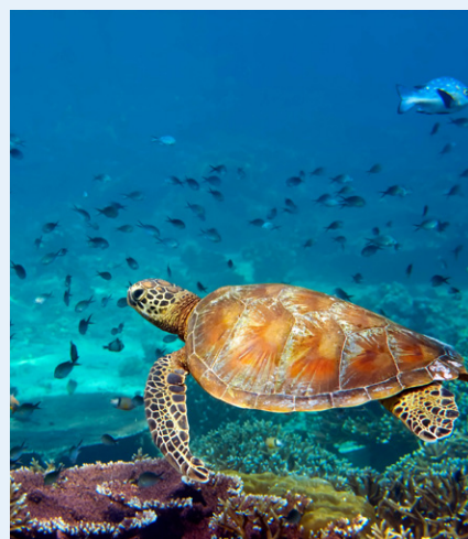
Green Sea Turtles at Punalu'u Hōnaunau