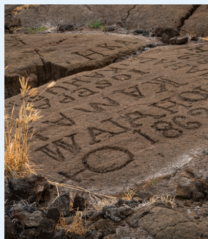
Petroglyphs in Waikoloa Field

The island's energy - mana - is palpable. Whether attending a hula performance at Waimea's Kahilu Theatre, volunteering for reef restoration, or supporting the island's small farms, affluent residents increasingly find meaning in connection and preservation.