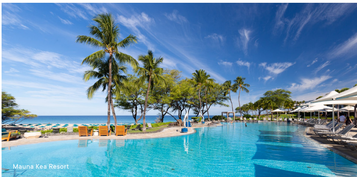
Mauna Kea Resort