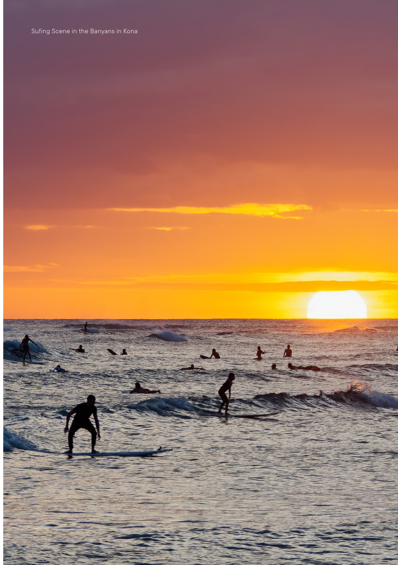
Surfing Scene in the Banyans in Kona

FOR MANY, THIS IS THE CHAPTER WHERE THE PACE SLOWS, THE SKY EXPANDS, AND LIFE FINDS ITS IDEAL RHYTHM. THE BIG ISLAND IS NOT SIMPLY A RETREAT. IT IS A REVELATION – ONE THAT INVITES YOU TO LIVE DEEPLY, PRIVATELY, AND IN HARMONY WITH NATURE'S GRANDEUR.