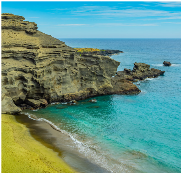
Papakōlea Green Sand Beach