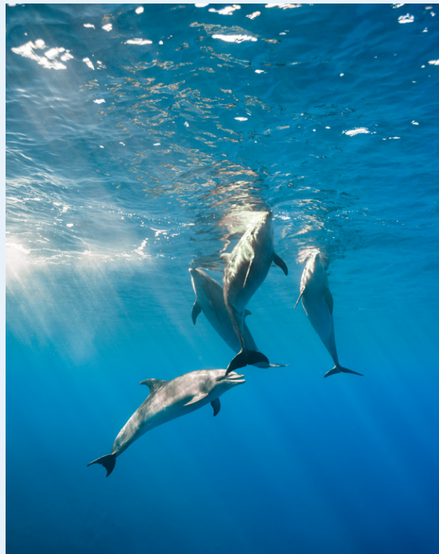
Dolphine Snorkeling at Ho'okena Beach

Beyond the estates, Big Island life offers endless recreation. Golfers enjoy championship courses at Mauna Lani, Mauna Kea, and Kukio. Deep-sea anglers pursue marlin off Kona's famed waters. Hikers explore Pololū Valley and Volcanoes National Park.