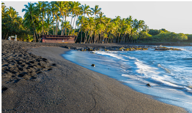
Punalu'u Black Sand Beach

Among the island's iconic regions, none has come to symbolize luxurious seclusion quite like the Kohala Coast. Nicknamed "Hawaii's Gold Coast," this stretch of shoreline runs north of Kona and is home to some of the most exclusive residential communities and resorts in the Pacific. Here you find privacy, safety, and refinement – balanced with the welcoming spirit of aloha.