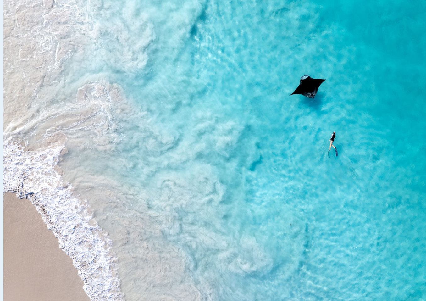
Swim with Manta Rays at Keauhou Bay

For cultural enrichment, the island hosts art galleries, farmers markets, and culinary festivals such as the Hawai'i Food & Wine Festival. For those arriving by private jet, Kona International Airport's upgraded runway easily accommodates Gulfstreams and Globals.