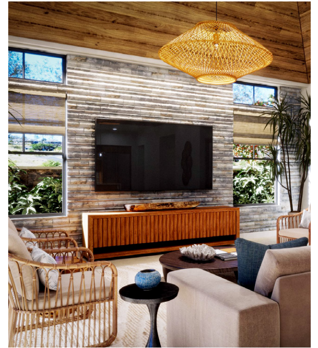
Nānā Kai Residence

MEDIAN HOME PRICES ACROSS THE ISLAND RANGE FROM $1,850,000 TO OVER $20 MILLION DEPENDING ON LOCATION AND EXCLUSIVITY, WITH PREMIUM GATED ESTATES COMMANDING GLOBAL BENCHMARK PRICING.