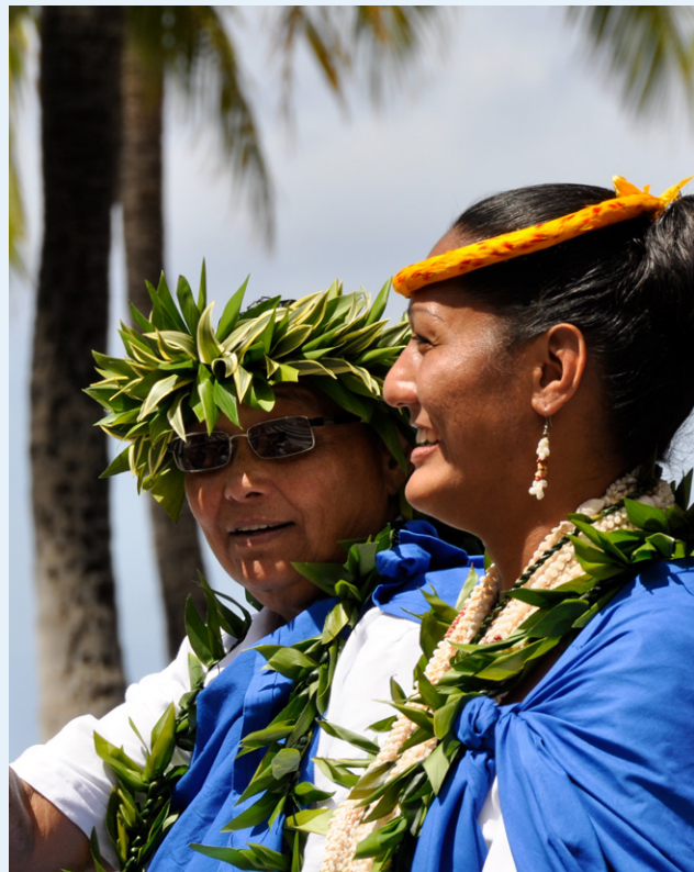
Residents wearing Lei Po'o (Head Lei)

Underneath the sophistication lies something much deeper - the Hawaiian way of life, guided by respect for the land ('āina), stewardship, and the spirit of generosity (aloha). Residents often describe a transformation that occurs once they begin living here: a greater sense of gratitude, mindfulness, and humility.