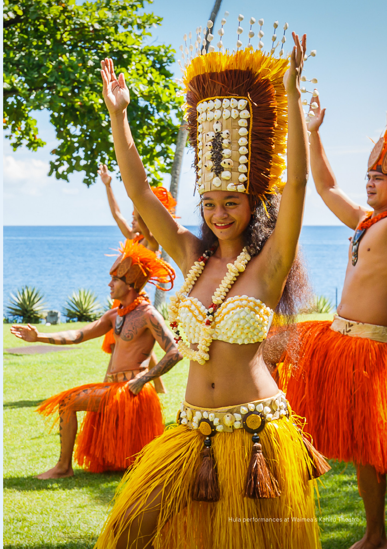
Hula performances at Waimea's Kahilu Theatre